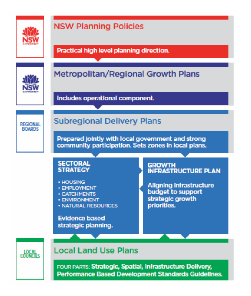
Figure 3: Proposed structure of strategic planning in NSW<sup>46</sup>

The proposed hierarchy of strategic plans will replace a raft of current planning instruments, as illustrated in Figure 4.