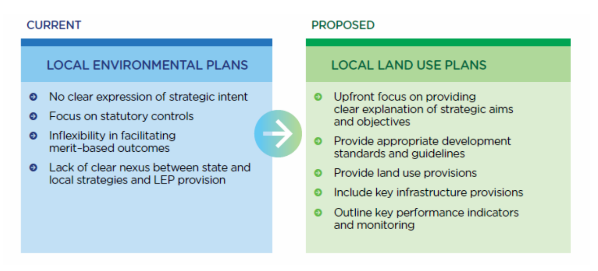
Figure 6: Proposed changes to Local Environmental Plans<sup>51</sup>

Local Land Use Plans will be structured in four parts: